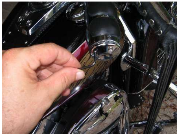
The Finished Key

Take the four short screws out of the end cap of the Kury grip, stick the Throttle Boss in, insert the provided 4 longer screws that come with the Throttle Boss going through the slotted, adjustable receivers and adjust to taste before tightening. The higher you set the Throttle Boss, the higher the speed at which it will be comfortable, the lower you set it, the lower the speed at which it will be comfortable.